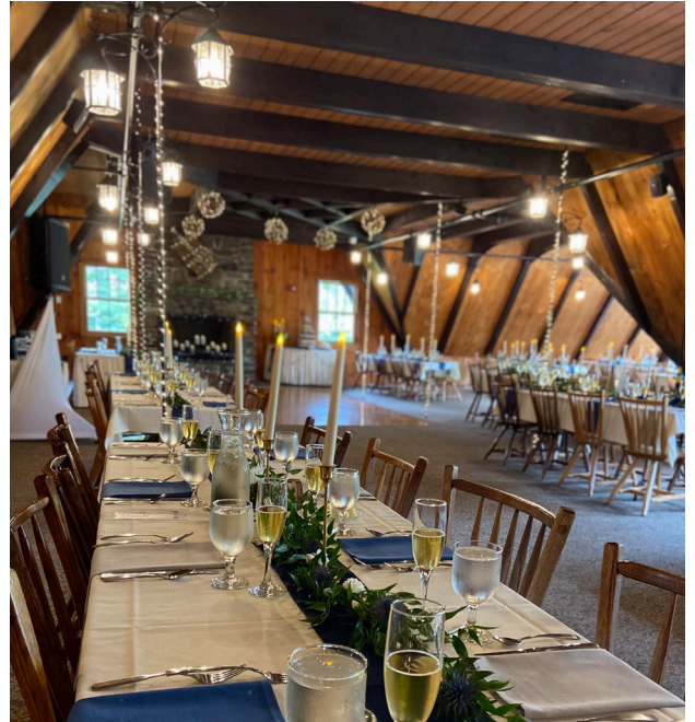
The Sleigh Room accommodates up to 200 guests.

The Sleigh Room has a large outdoor deck for stunning mountain views for your guests, complete with additional outdoor seating & heat lamps for when the weather is perfect to sit outside with a cocktail & take in the views. The Oak Room level provides an indoor ceremony site for not so favorable weather and is attached to the outdoor ceremony site on our stone patio. The bridal suite for the Sleigh Room is located on the lower level. The Main Lodge is equipped with an elevator for easy access to all three levels of the lodge. You are sure to enjoy the beautiful rustic charm of the Sleigh Room.